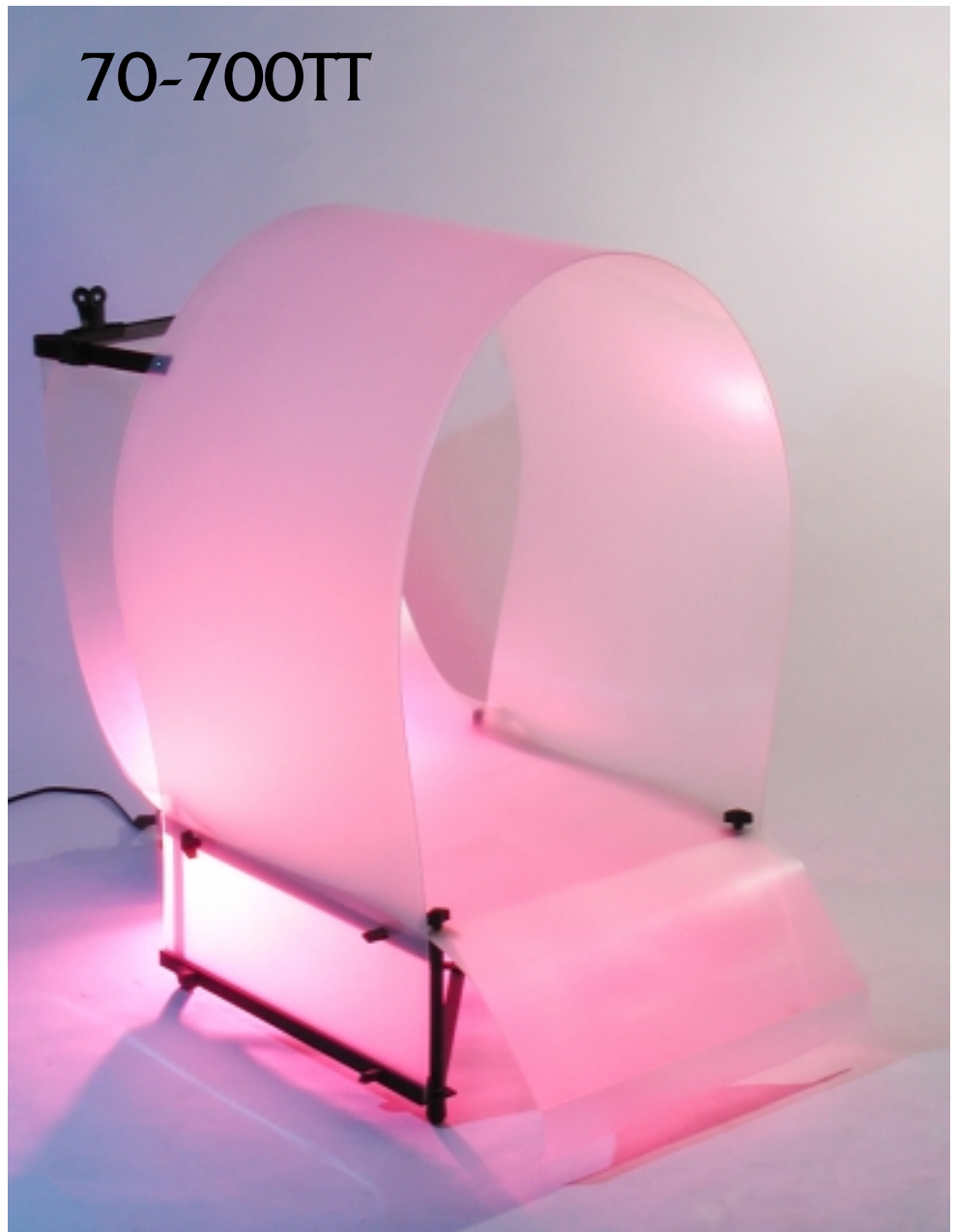
The Digital BAREBulbs are the only light source of this Table-T-able photo