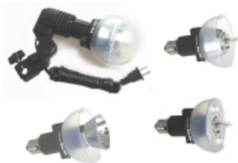
Light pattern can be altered by switching reflectors on Digital BABEBulbs