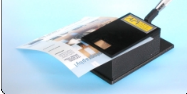
Model #11-044 3 sides open for 8x10 sheet