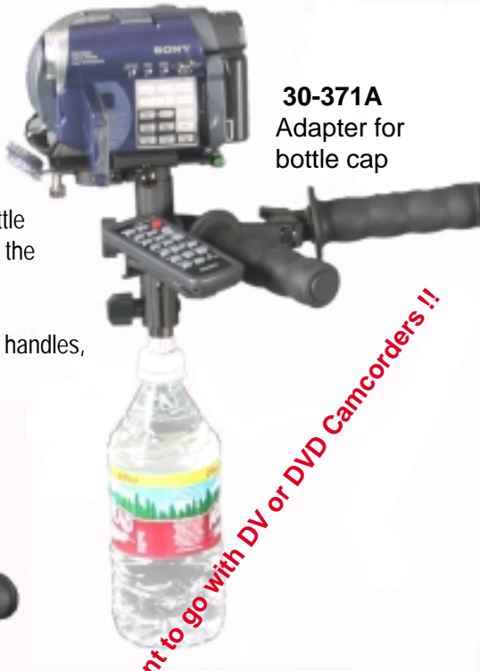
30-371A Adapter for bottle cap

If travel light is important, it is possible to use disposable water bottle as counter-weight, so only the floating head plus an optional adapter are needed. Simply make a hole on the bottle cap, affix the adapter, then insert it into the floating head receptacle, and lock it. (you can drink the water and trash the plastic bottle afterward, break down the handles, and store it easily)