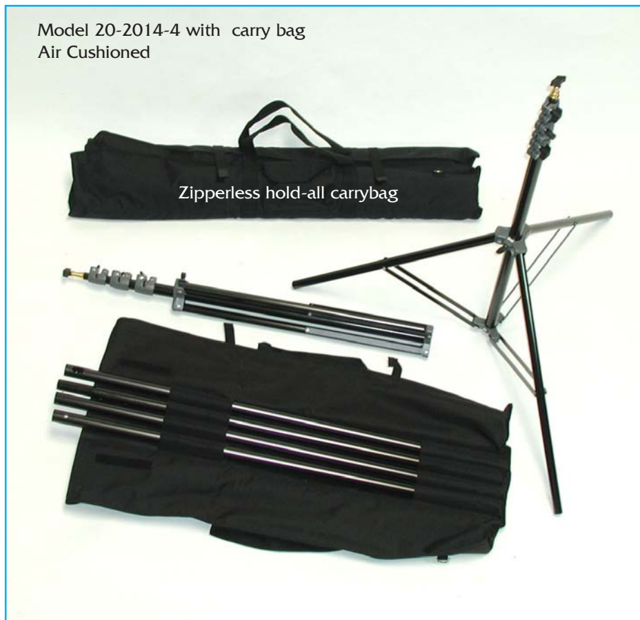
Zipperless hold-all carrybag