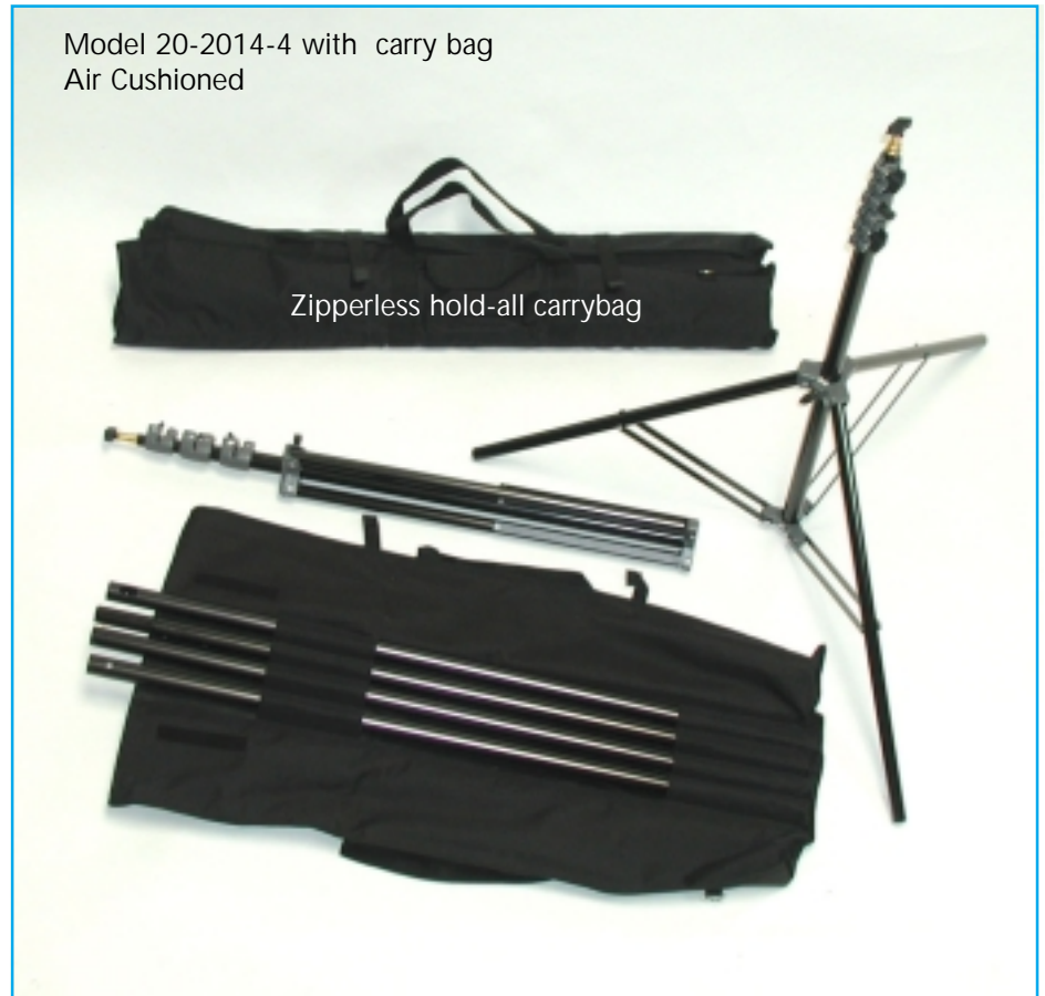
Zipperless hold-all carrybag